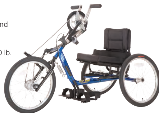
Model #: LXC

20" Cruiser wheels and tires Quick release axles 9° camber Cushion and hook and loop seat restraint Choice of 11 colors Weight capacity 250 lb.