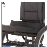
Li'l Excelerator-2 - Handcycle