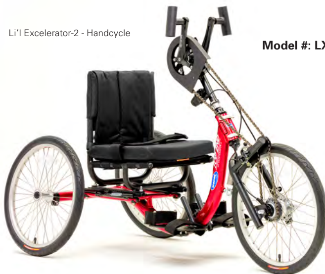
Model #: LXC2H